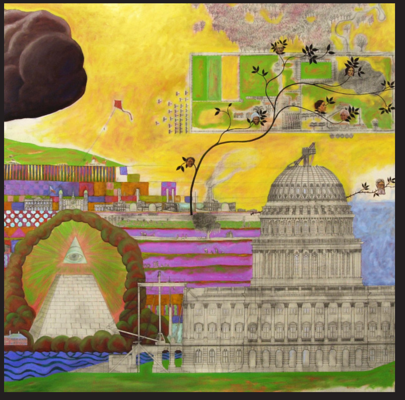
Bruce Linn - Personal Work