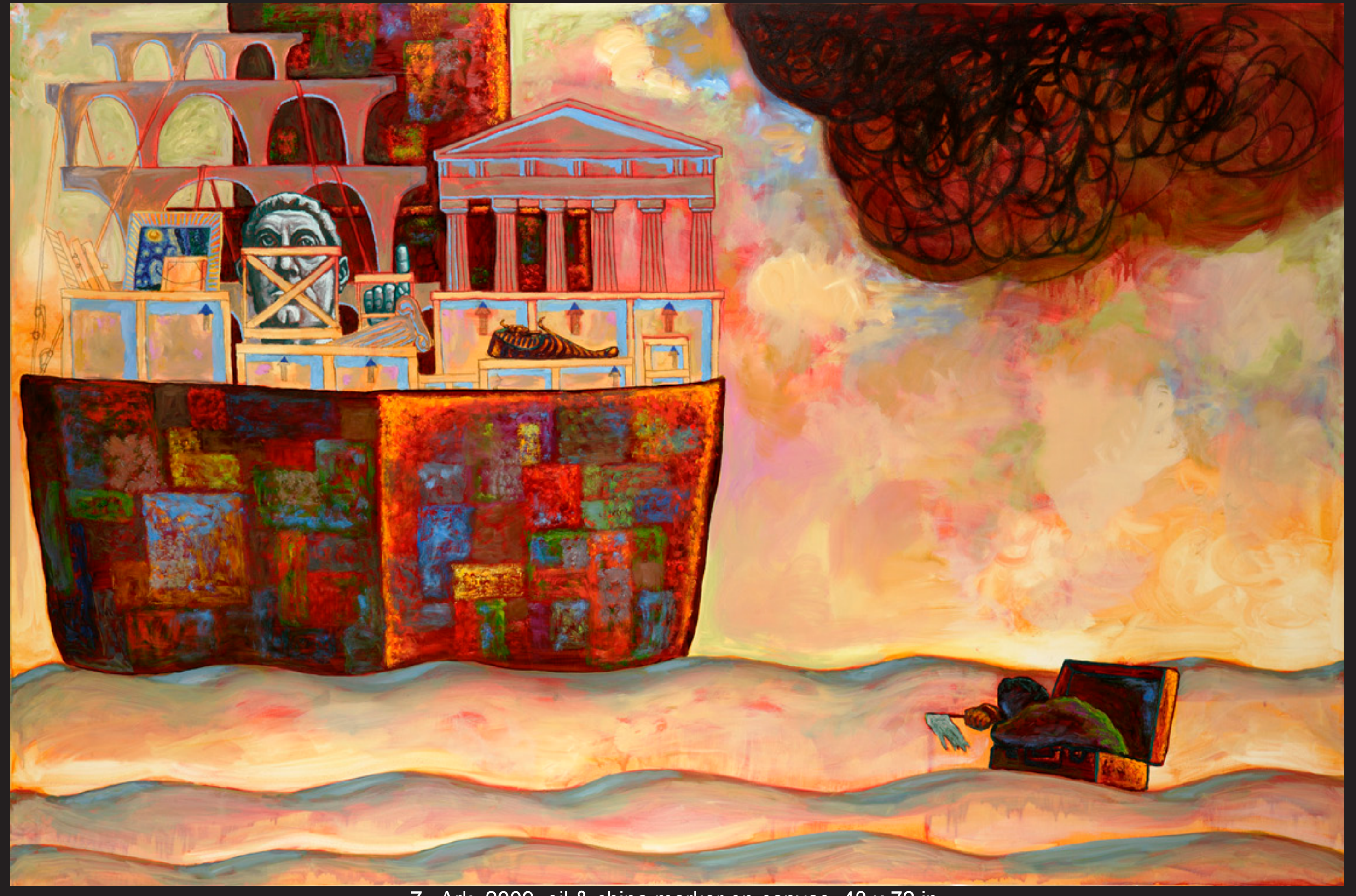
7. Ark, 2009, oil & china marker on canvas, 48 x 72 in.