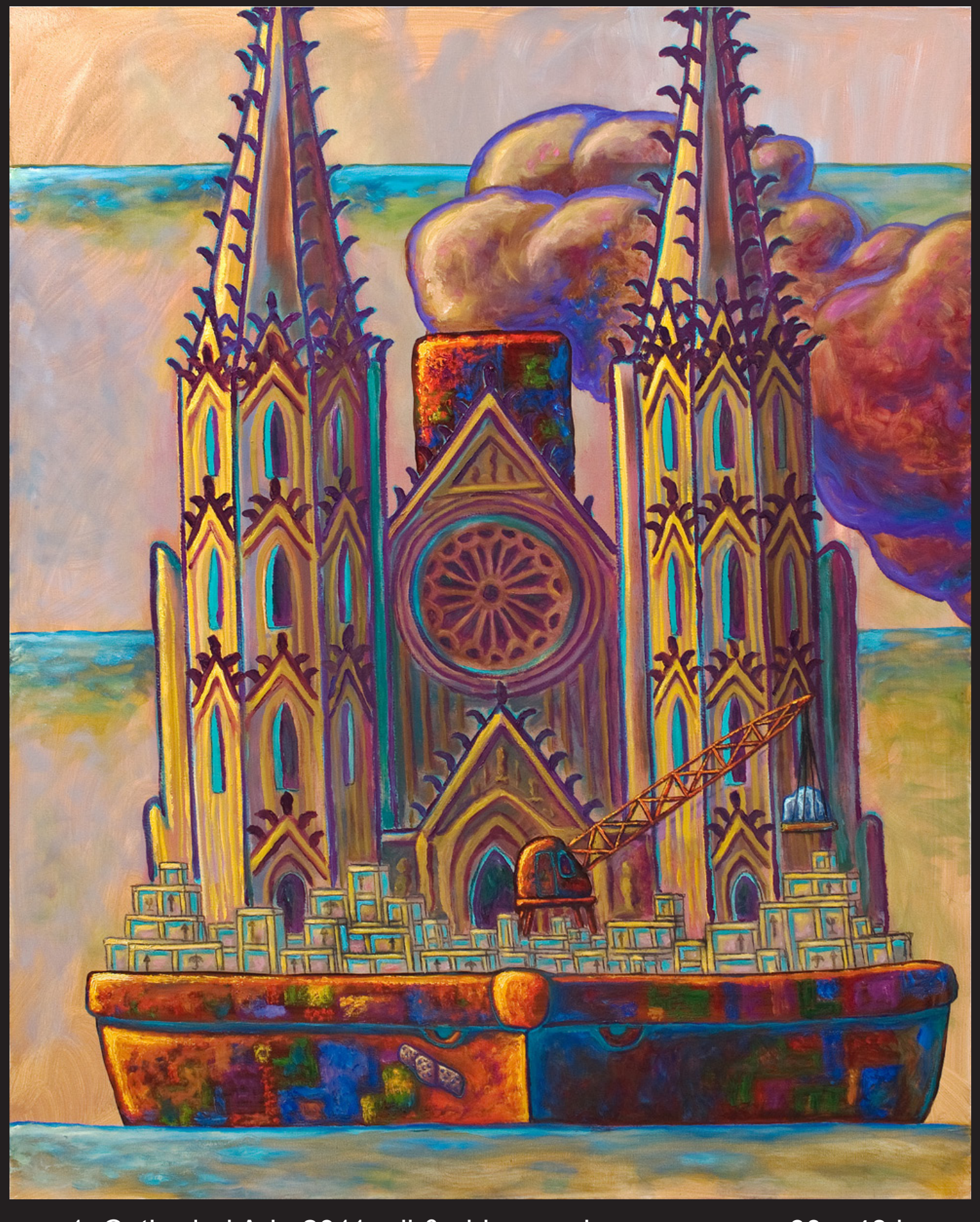
1. Cathedral Ark, 2011, oil & china marker on canvas, 60 x 48 in.