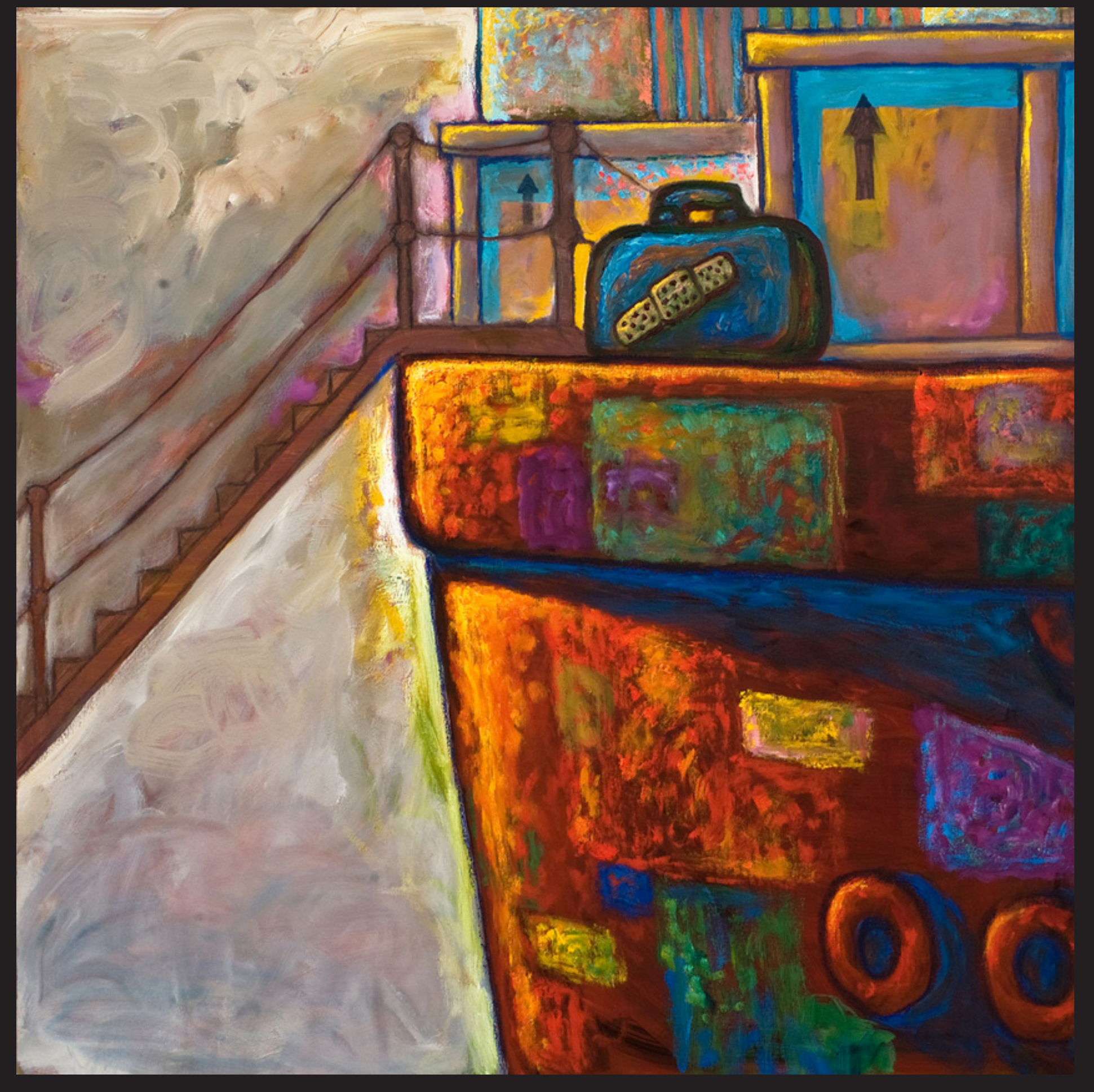
4. Orvieto Duomo Ark Composition (DETAIL - Suitcase), 2011, oil & china marker on canvas, 40 x 40 in.