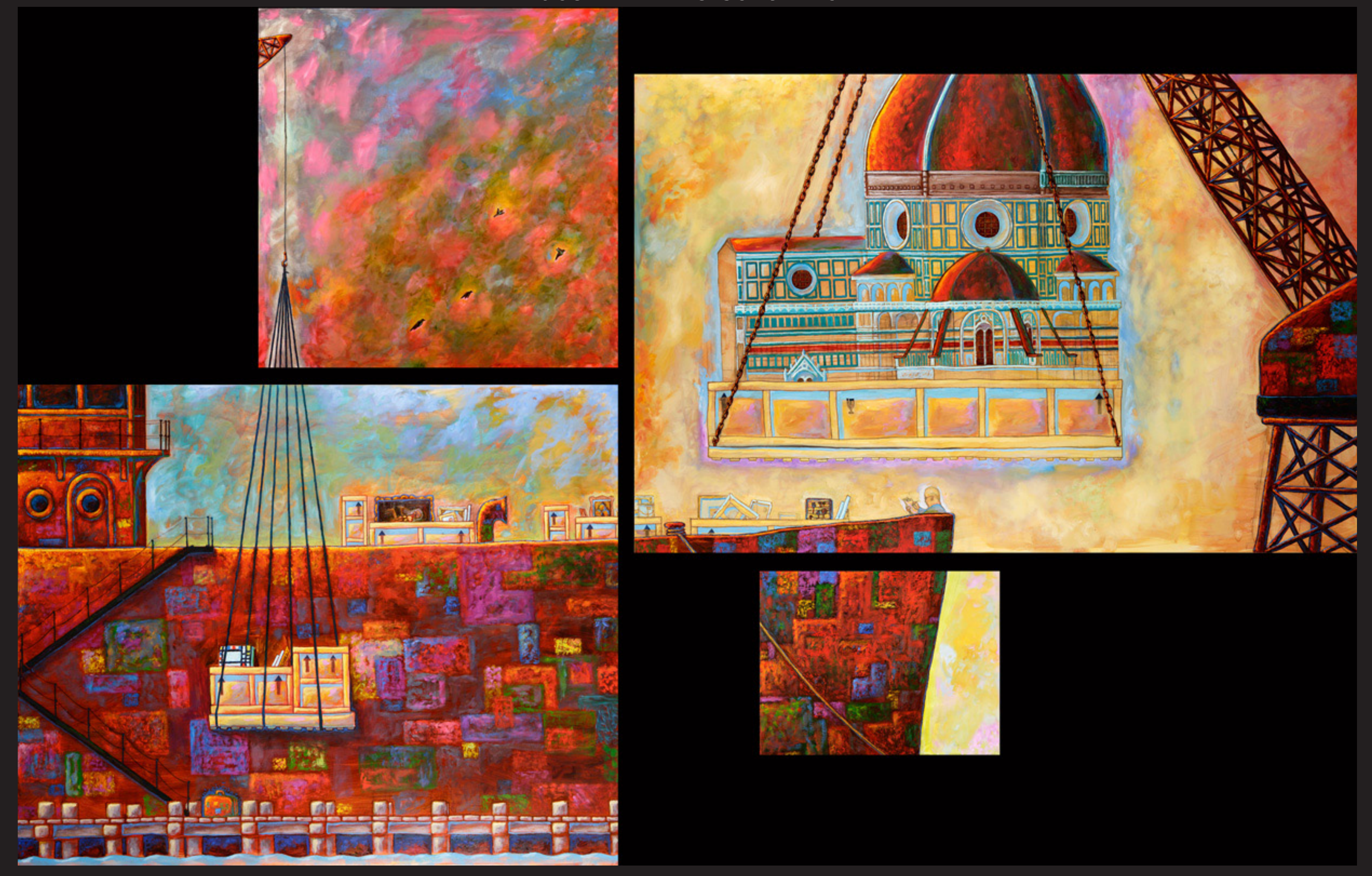
8. Florentine Duomo & Ark Composition, 2009, oil & china marker on canvas, (four canvases) 87 x 138 in.