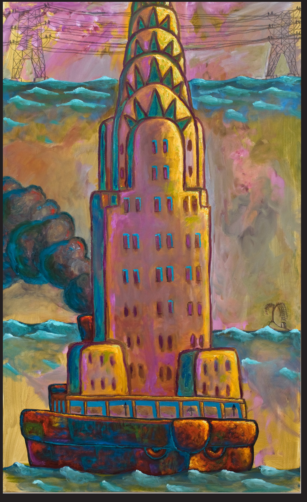
2. Chrysler Building Ark, 2011, oil & china marker on canvas, 60 x 36 in.