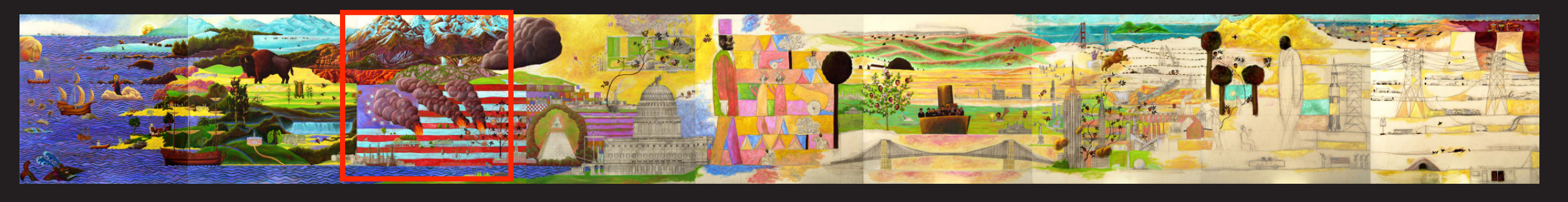
14.Building America, Revolutionary Period (Panel 3 of 9), 2001, oil and graphite on canvas, 72 x 72 in.