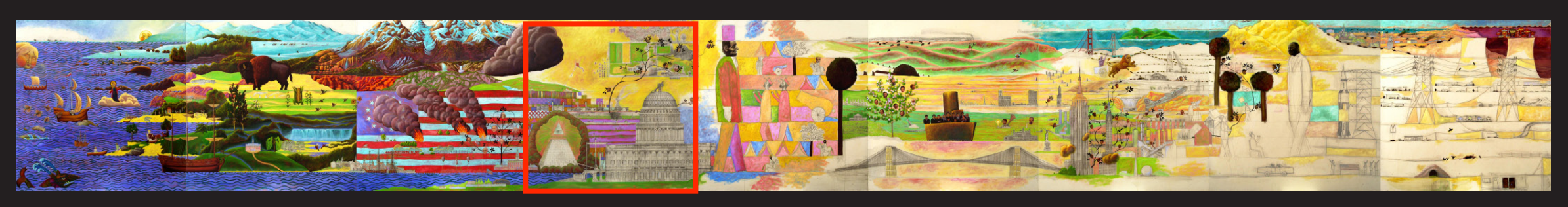
15. Building America, Ante-Bellum Period (Panel 4 of 9), 2001, oil and graphite on canvas, 72 x 72 in.