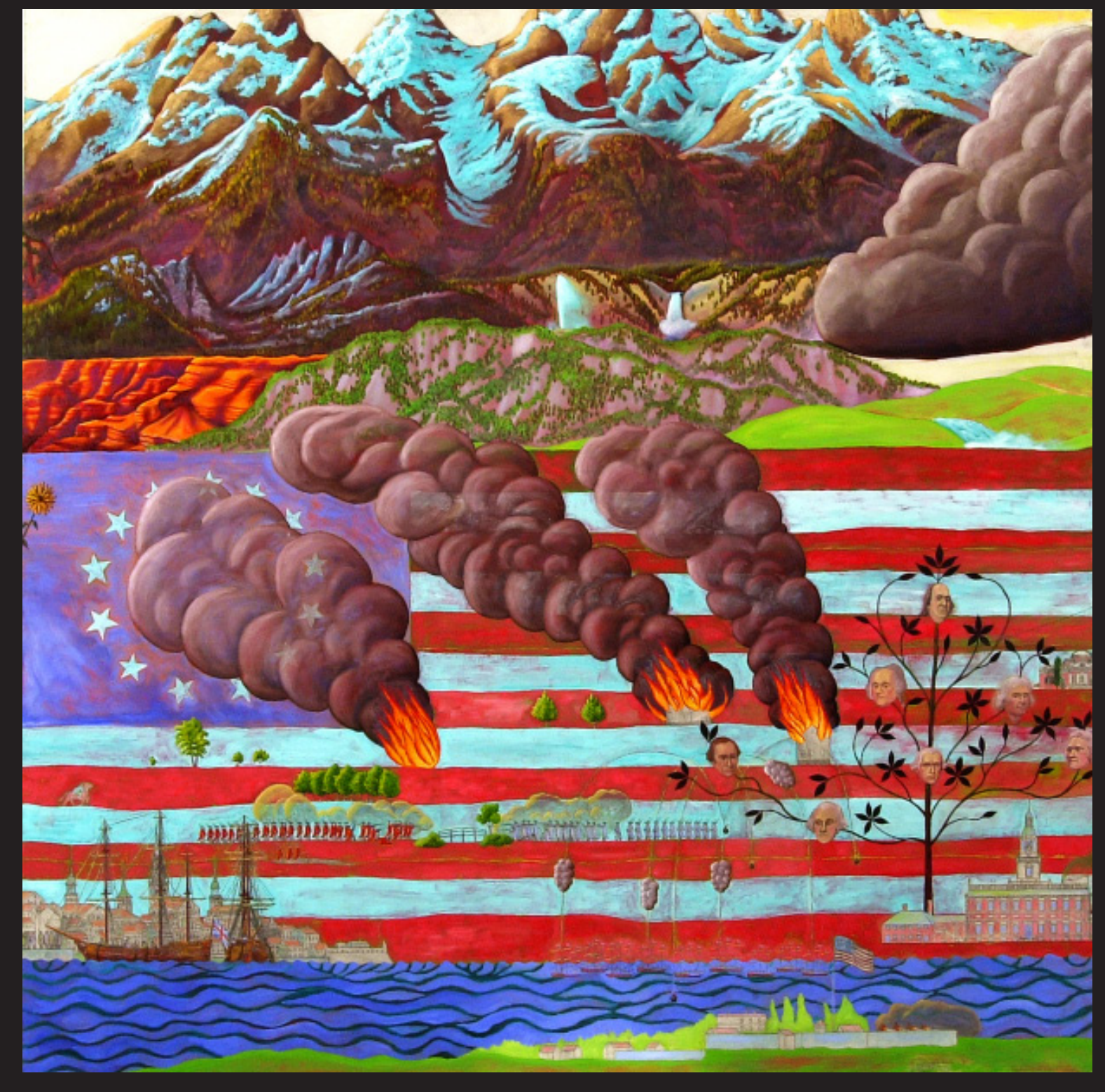
Bruce Linn - Personal Work