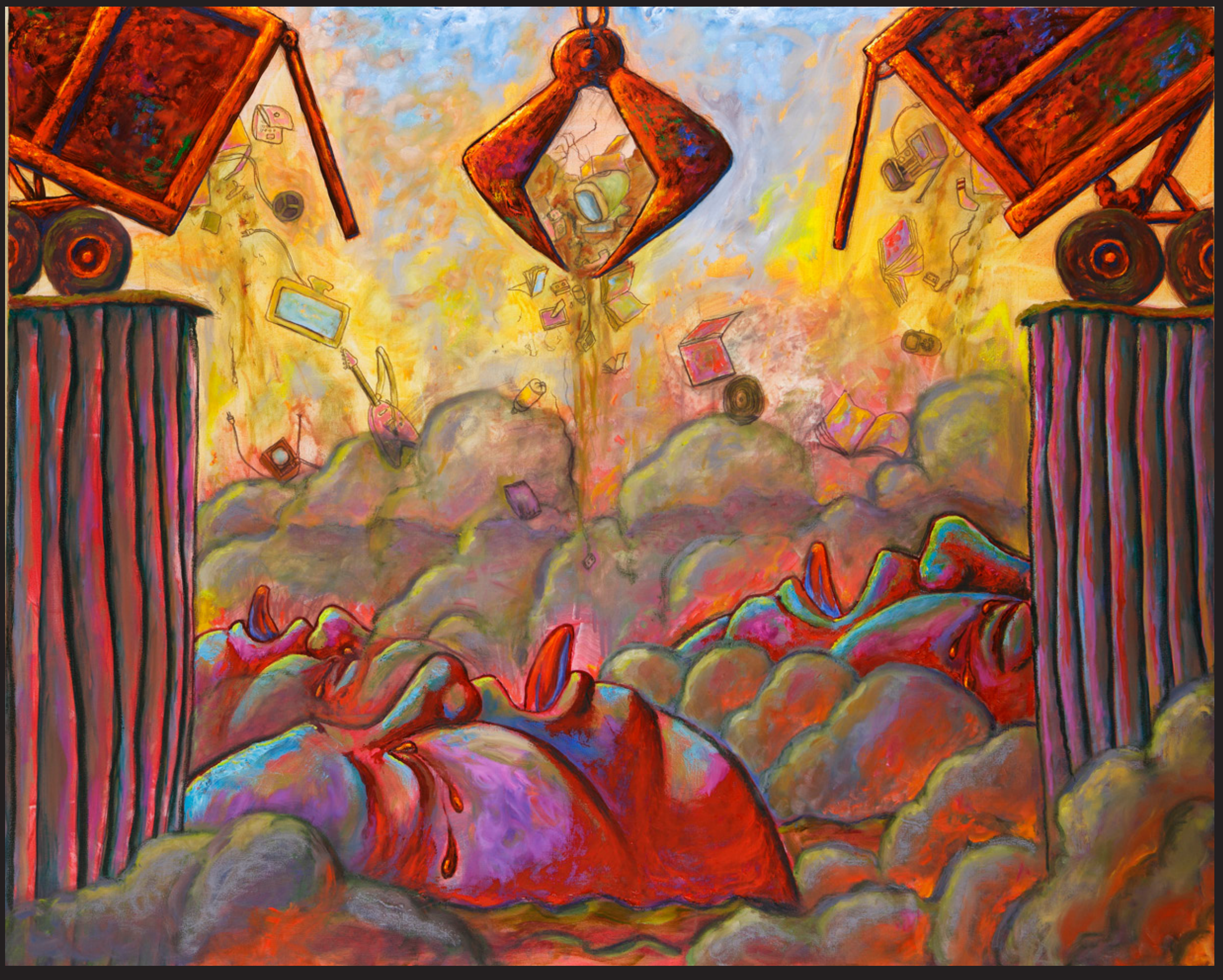
6. Landfill (Feeding the Philistines), 2010, oil, graphite & china marker on canvas, 48 x 60 in.