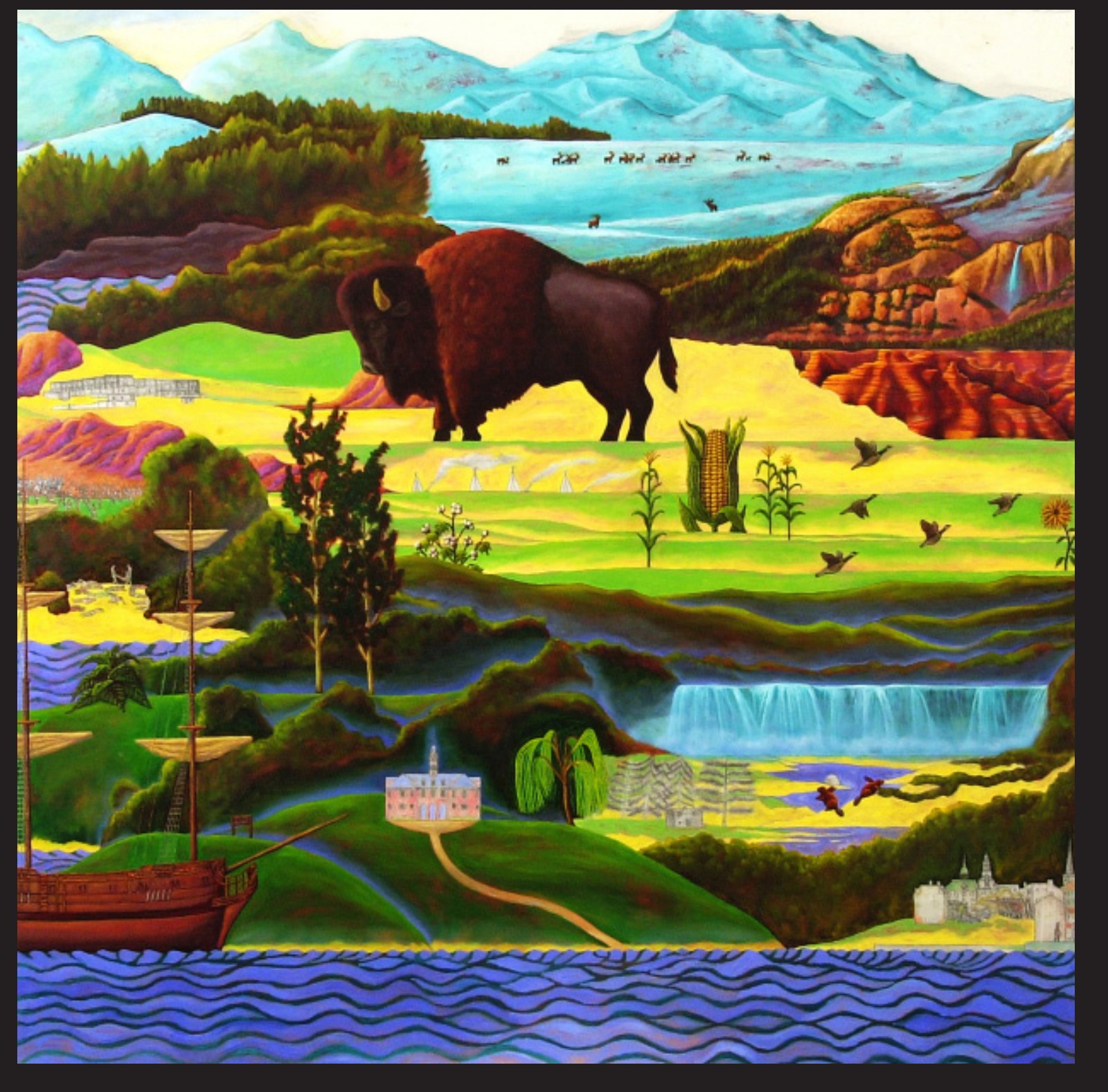
Bruce Linn - Personal Work