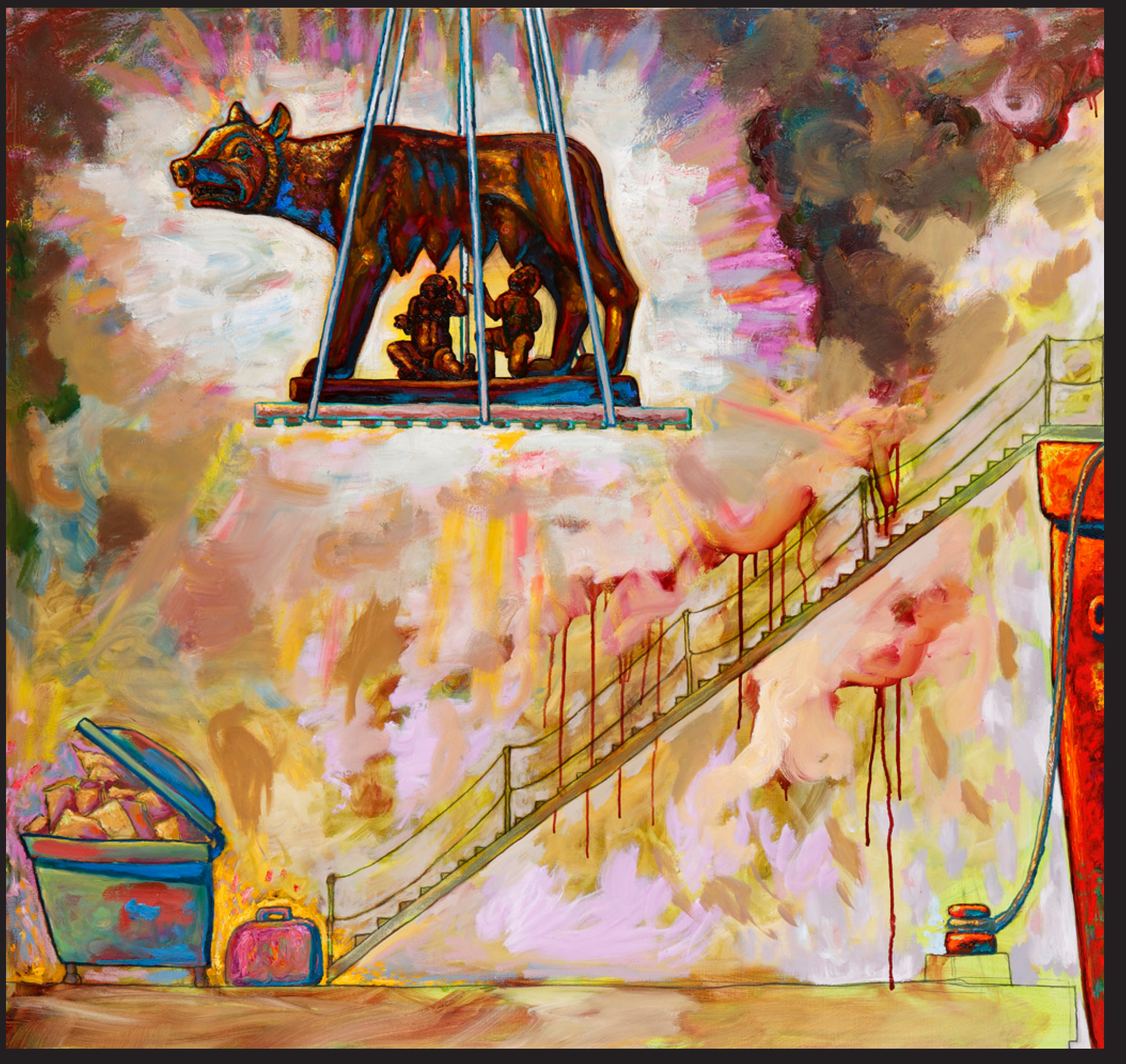
5. Dumpster, Suitcase, Remus & Romulus, & Ark, 2010, oil & china marker on canvas, 48 x 60 in.