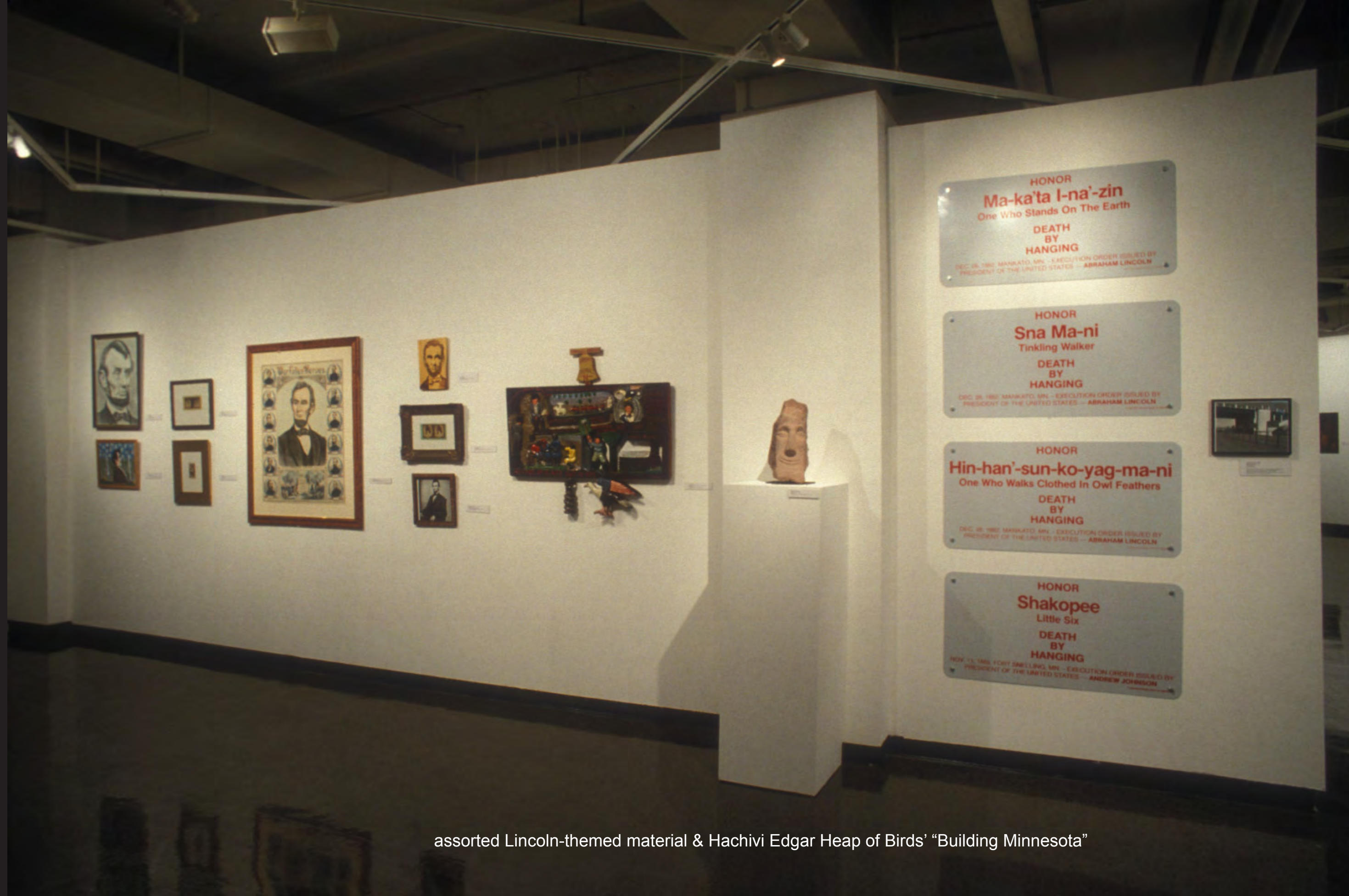
assorted Lincoln-themed material & Hachivi Edgar Heap of Birds' "Building Minnesota"