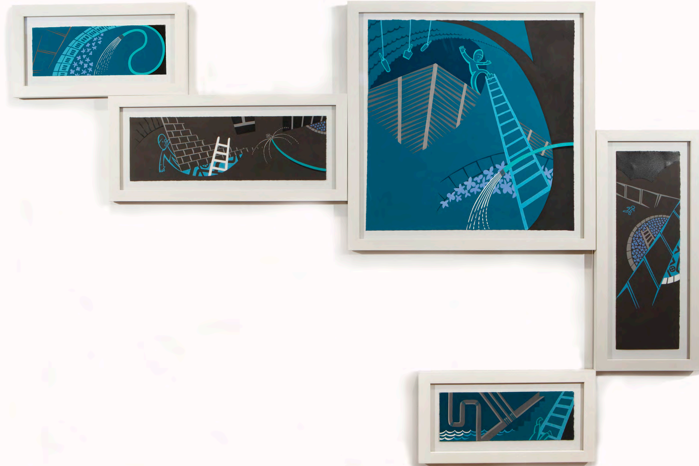
Steven L. Jones

experimentation - composing with multiple panels